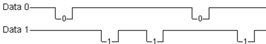
Figure 2 Data1 / Data0 signaling (01101)

Wiegand signaling is significantly different. It uses two separate data lines (“Data 1” and “Data 0”) to pass data to the panel. As the name suggests, Data 1 is used to carry the “1” bits to the panel and the Data 0 line carries the “0” bits. For both data lines, the voltage is normally high (5V). When a bit is signaled, the voltage on the appropriate line is pulsed to zero (0V) volts. The Control panel listens on both data lines and records the bits as they arrive.